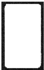
5. Fully coated surfaces

Actual floatation coating instructions are as follows :